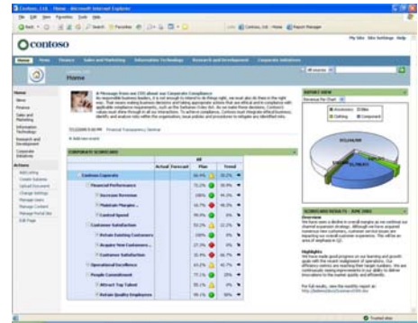
Fig. 2 - Easily define and articulate your business strategy.